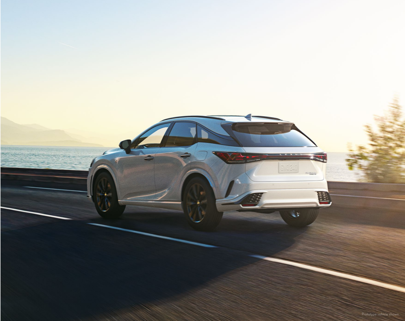
Prototype vehicle shown.

275 HORSEPOWER 3 TURBOCHARGED IN-LINE 4 ENGINE