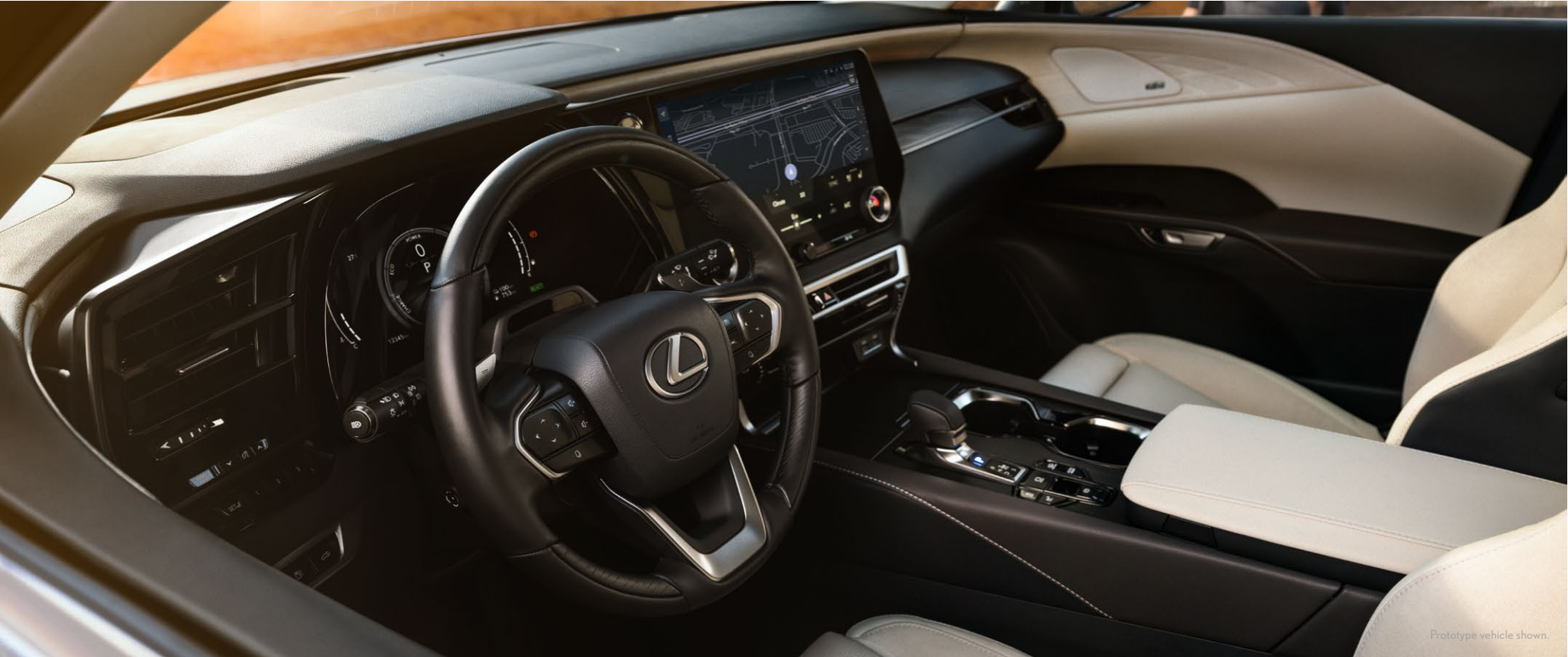
Prototype vehicle shown.

Available on all models: Traffic Jam Assist 27 Lexus Digital Key 11 Cold Area Package Towing Package