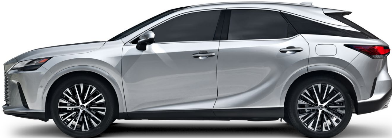
Prototype vehicle shown.

intelligent, it becomes an extension of you. An all-new platform delivers refined comfort and nimble handling. And pushing exhilaration to even greater heights, the first-ever RX F SPORT Performance introduces an advanced hybrid powertrain—and is the fastest RX ever. 2 This is the next generation of luxury, as you've never experienced before. This is the new RX.